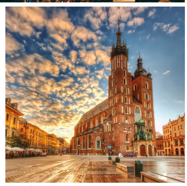
The interior and exterior of St. Mary's Basilica \blacktriangle